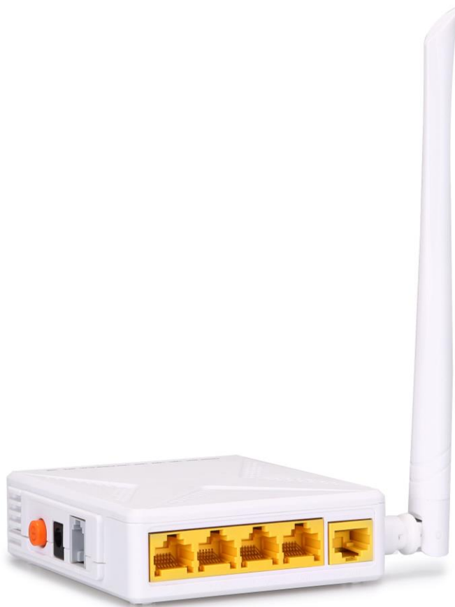
Figure 1 G/EPON 1GE+WiFi ONU

ATA341 is based on the Ethernet technology mature and stable, high cost performance, combined with 802.11n wireless technology (1T1R), L2 Ethernet switching technology and high quality VoIP technology, high reliability, easy management and good quality of service (QoS) guarantees, etc.